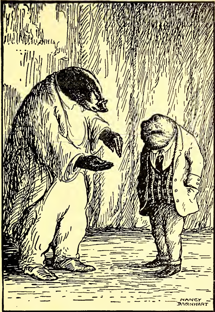
LONG-DRAWN SOBS FROM THE BOSOM OF TOAD